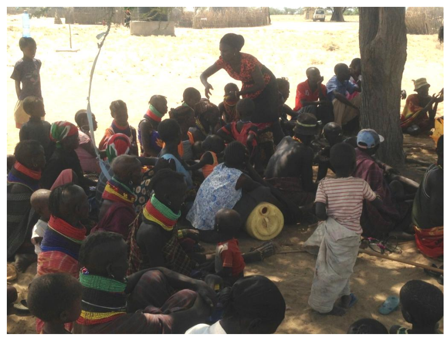
Figure 7: Behavioural trial through the use of a community baraza in Lorengelup, Turkana

Both communities were greatly surprised and pleased to discover how little water could be used to wash a child's face, and that a leaky tin could easily be made and used in their own homes.