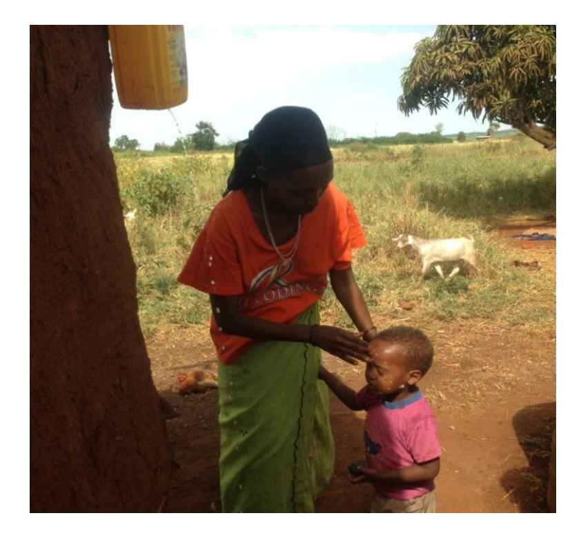
Figure 8: A women washing her child's face using a leaky tin constructed following the behavioural trial in Leyai, Marsabit