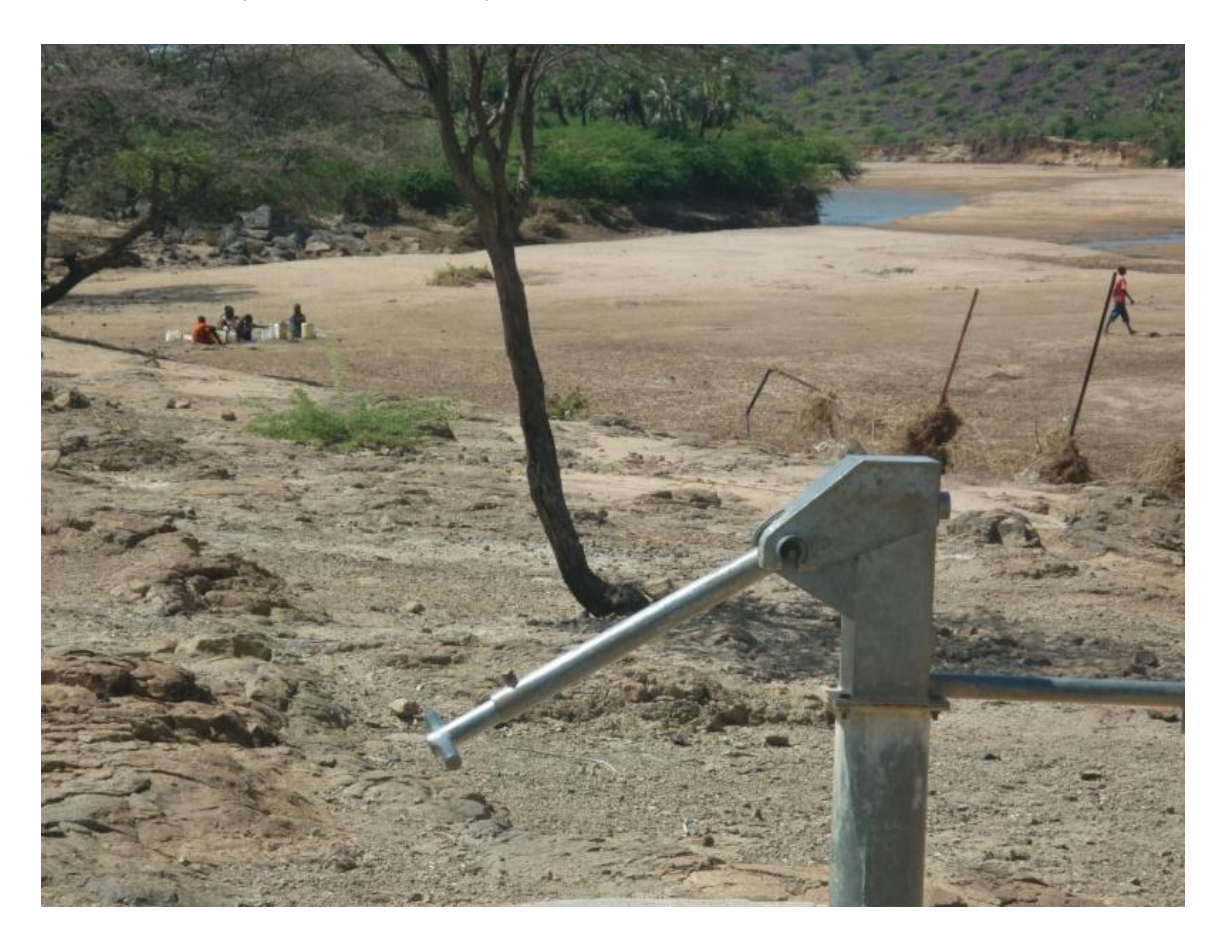
Figure 3: People drawing water from a shallow well, avoiding payment. The pump is broken

This study was conducted shortly after the rains and water could be collected more quickly and easily from shallow wells than is likely at other times of year.