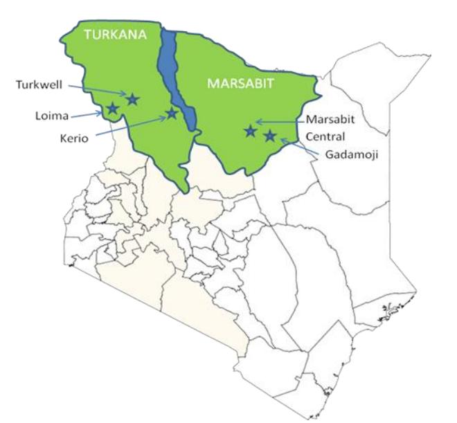
Figure 2: Map showing the divisions where study was carried out (six sites in five divisions) in Turkana and Marsabit Districts, Kenya

The study was conducted in three settings in Turkana district (Kerio, Turkwell and Loima divisions), in villages in Kakimat, Lorugum and Lokiriama sub-locations. In Marsabit County, the three study sites were located in Gadamoji and Marsabit Central divisions, in villages in Songa, Hula Hula and Qilta sub-locations. The study areas are characterised by perennial water shortages, inadequate sanitation, poor hygiene and poverty. Figure 2 shows the point location of the five divisions where the six study sites were located.