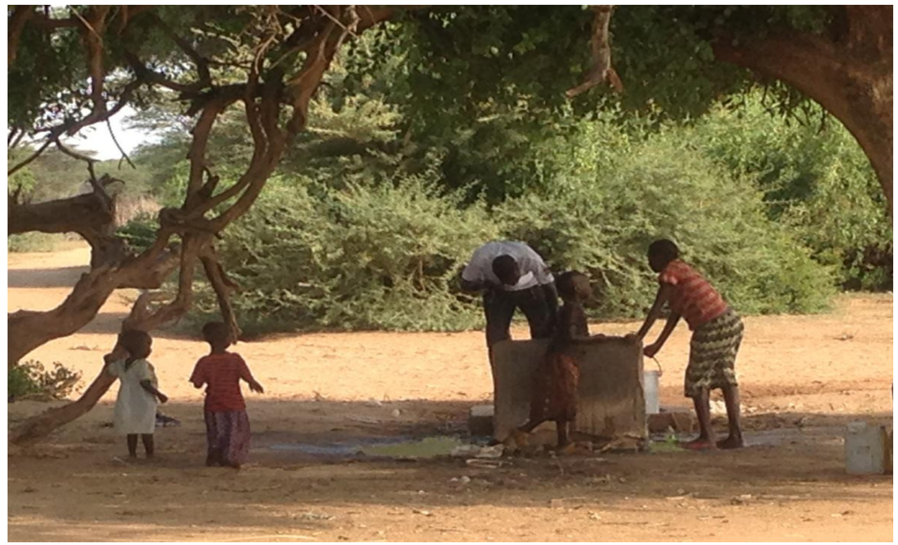
Figure 4: Water point observation in Turkana