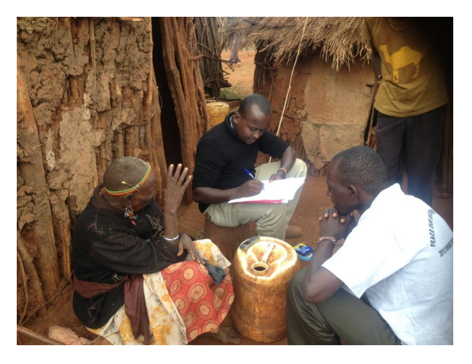
Figure 6: An in-depth interview with a woman with trachomatous trichiasis